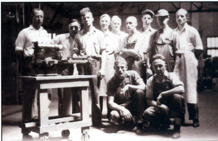
Plant employees, circa 1938

Inclinator Company of America, started in 1923 from an idea to help a sick friend in Harrisburg, has grown into a vibrant, innovative company marketing products being used in all 50 states and in many foreign countries as well. 🌐