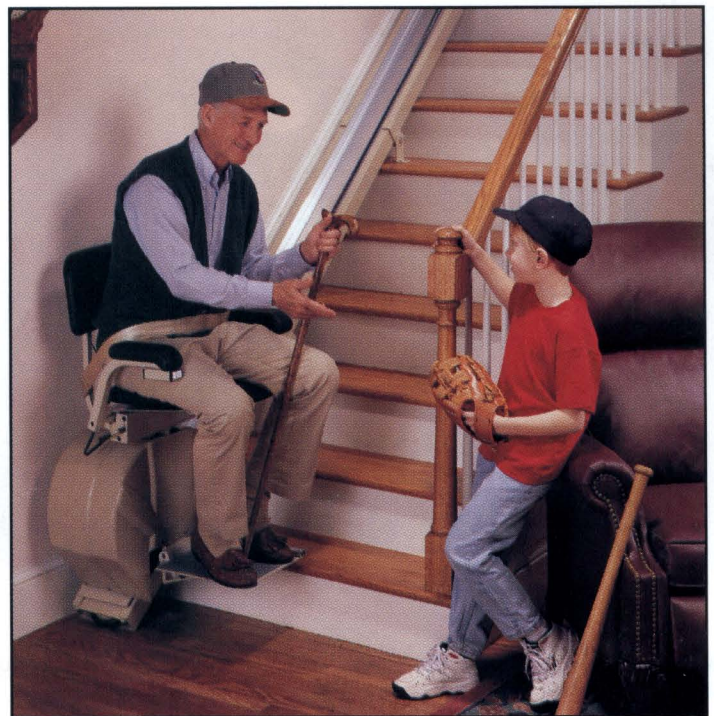
StairLIFT SC®, a modern-day product