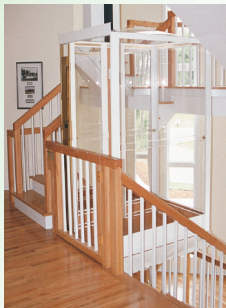
An Elevette can be a centerpiece of your design.

Inclinator handcrafts each Elevette® elevator so you can choose from options like door placement, interior wood finishes, handrails, lighting, gates and control plates.