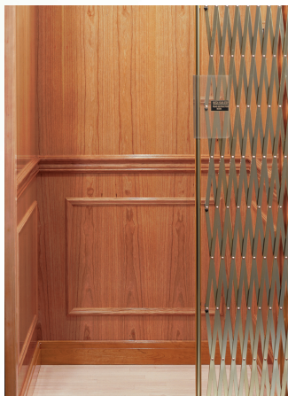
Classic styling will complement any décor.