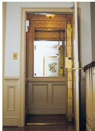
Special touches make each Elevette one-of-a-kind.