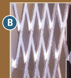
B Cab Gate: collapsible (in various finishes) for all door types. Can be sold without a gate, with a 3" lip. (where allowable by code)