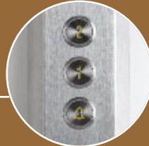
Cab Operating Panel, with Hall Station at each landing's door