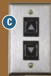
C Call Buttons (in various finishes) for builder-supplied swing door. Commercial-grade doors have call buttons shown on page 6.