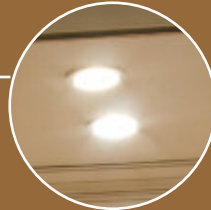
LED ceiling lights