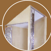
Lots of custom possibilities, like a sloped ceiling to accommodate home's design