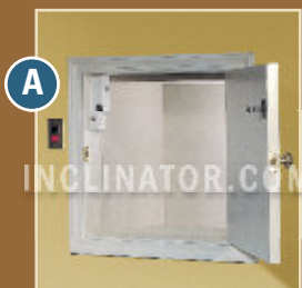
A Hoistway Door: Have your builder design and install a custom swing door, or choose a commercial-grade bi-parting, slide-up or swing door (shown on page 6).