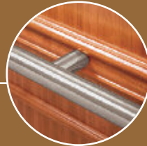
Wood or metal handrail