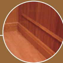
Many wood species or laminate choices for walls, floor, ceiling and accessory elements