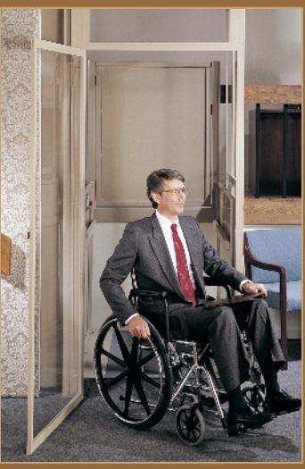
Ideal for many indoor applications (with or without an enclosure).

Landing gate has interlock to open only when platform is at landing.