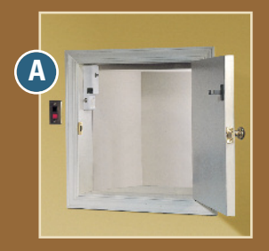
Hoistway Door: Have your builder design and install a custom swing door, or choose a commercial-grade bi-parting, slide-up or swing door (shown on page 6).