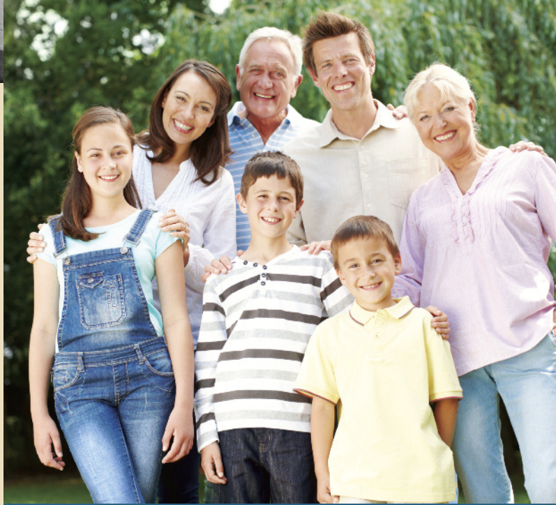
There are more Inclinator elevators in homes throughout the Americas than any other brand.

Not having to walk stairs makes living in your home easier. It gives people in wheelchairs, those needing walkers or people just having difficulty climbing stairs the ease of accessing every floor of their house ... giving them more years in the home they love ... with the people they love.